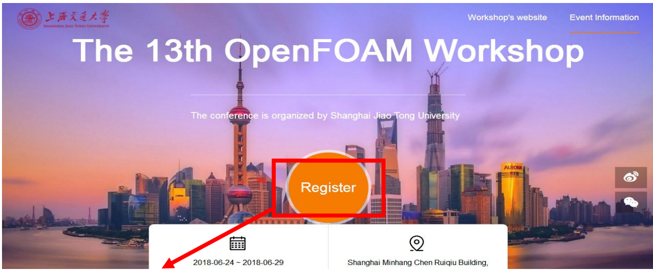
Click on "Register" and then "Sign up now!" in the pop-up window.